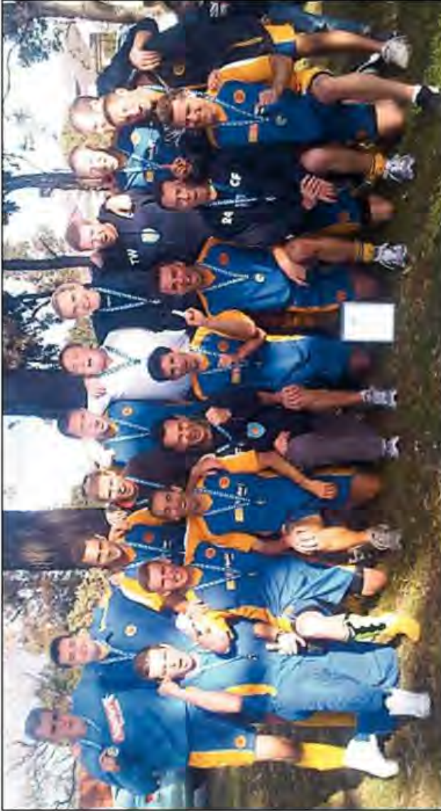
West Pymble over-35s team defeated Fairfield's AC United 4-1 to win the State Cup.

ball team can celebrate being the best team in NSW."